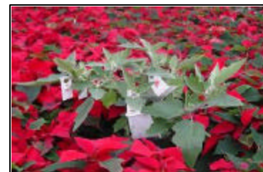
Eggplant GPS in poinsettias.

Techniques are being developed to utilize trap plants to attract the pest as well as sustain natural enemies in greenhouses. The trap plant could provide a continuous source of the pest, which could provide a cost-effective, on-going supply of their natural enemies. The GPS offer several IPM roles: 1) an indicator plant to attract the pest early, 2) a trap plant to draw the pest from the crop, and 3) a banker plant to provide a sustained source of beneficials.