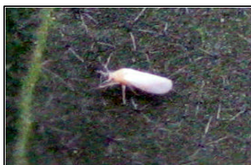
Silverleaf whitefly adult.

We tested eggplants (var. Fairy Tale Hybrid) as a GPS in poinsettias at two Vermont commercial greenhouses for whitefly control. Eretmocerus eremicus , a parasitoid that attacks nymphs of both greenhouse and silverleaf whiteflies, was released weekly on the GPS. We monitored whitefly and parasitoid numbers on the GPS, yellow sticky traps and the poinsettias throughout the fall growing season until mid-December to evaluate the effectiveness of the GPS as an IPM tool.