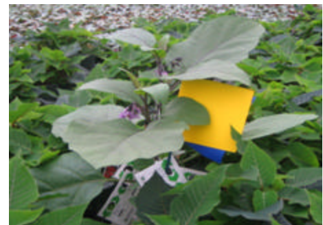
Eggplant banker plant for Encarsia in Canadian poinsettia crop.

Timing is everything for biological control, and early intervention is critical for success. Research is underway to assess the effectiveness of banker plants as a reservoir for alternate hosts of biological control agents. These systems can be a cost effective way of providing a continuous supply of beneficials which spread throughout the greenhouse searching for the pest. The beauty of this system is that the beneficial organism will be sustained even if the pest population is very low. We are testing barley plants inoculated with bird-cherry aphids (which feeds on barley, not bedding plants, so they won't become a pest) to support Aphidius , a parasitic wasp of several pest aphid species. In addition, research is ongoing to evaluate marigolds as banker plants for predaceous mites to manage both thrips and spider mites. We also hope to try other banker plant systems such as eggplants inoculated with whitefly to support Encarsia and Eretmocerus , two whitefly parasites.