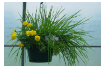
Habitat Plant System in a hanging basket

Habitat Plant Systems (HPS) are a complex of plants grown together to provide a suitable environment for sustaining beneficial insects and alternate hosts. Banker plant systems are similar to HPS, but usually involve only one plant species. We evaluated the effectiveness HPS and banker plants to sustain and attract beneficial insects for suppression of thrips and aphids.