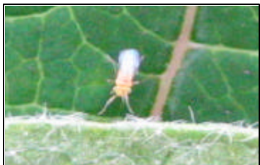
Eretmocerus eremicus adult.

Early pest detection is essential for successful greenhouse IPM. By detecting problems early, growers can manage pest populations when they are low and localized. Insect pests are attracted to some plant cultivars more than others and act as a trap plant, drawing the pest away from the crop. Eggplants have been shown to effectively serve as a trap plant for whiteflies. So why not use the trap plant as a site for controlling the pest by providing their natural enemies on the plant too? In 2007, the PIs of this project sought to assess the use of eggplants as Guardian Plant Systems (GPS) in poinsettias, bedding plants and tomatoes. The GPS would first attract whiteflies from a crop, and then serve as a site for releasing parasitoids to control the pest. This report summarizes the results to date of research done at the Univ. of Vermont in poinsettias.