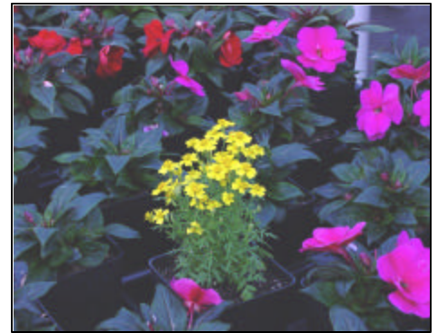
Lemon Gem marigold serving as indicator plant.