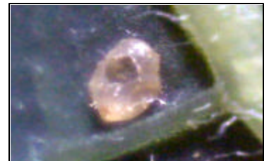
Empty parasitized whitefly nymph.

In one test greenhouse where the GPS was used, no chemical pesticides were used in the finishing phase of poinsettia production, though in past years the grower had made one or more applications. At the beginning of the season a moderate number of whitefly were detected, but after the parasitoids became established, the population remained at low levels throughout the rest of the season. In the other test greenhouse, pesticide usage was reduced by 50% compared to equivalent greenhouses (2 vs 4 pesticides) where the GPS was not used. At the start of the season, this site had a moderate-high, level of whitefly infestation. The whitefly infestations became so high on the GPS that they were removed so they didn't serve as a pest source. Overall, the GPS system has a great potential to be an effective tool for the reduction of pesticide use in commercial greenhouses. If used throughout commercial greenhouses, a significant reduction in pesticide use would be realized. Better sanitation practices and reduction of residual whitefly populations before the season begins would enhance the effectiveness of the GPS.