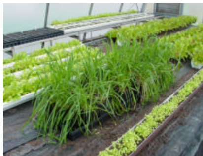
Barley plant banker system in greenhouse lettuce crop.

The barley with the bird-cherry aphids provided a suitable habitat for the Aphidius colemani parasite population. The parasites were released into the BMP house in January onto the barley/aphid banker plants, and later were found parasitizing the aphids on the barley in the HPS. This demonstrated the parasite's ability to search out its host. The parasite population was sustained at high levels throughout the summer. Despite the removal of the HPS and banker plants in late July, resident Aphidius continued to be sustained in the BMP house, where it suppressed an outbreak of green peach aphid on mums. Hyperparasites, tiny wasps that parasitize the Aphidius after it lays an egg in the aphid, were observed in the greenhouse in late July, and may have entered from outside. These hyperparasites significantly reduced the effectiveness of Aphidius . To combat the hyperparasite