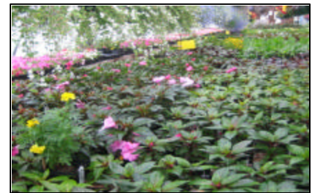
Indicator plants and yellow sticky trap in a commercial greenhouse.

Early detection of pests is essential for effective IPM. It enables growers to address pest problems when they are low and localized with biological control or a “soft” pesticide before a serious outbreak occurs. Indicator plants are varieties that are particularly attractive to pests. We finished a 3-year study assessing the effectiveness of two varieties of marigolds (Lemon Gem and Hero Yellow) and compared to yellow sticky cards (YSC). These data show thrips can be detected as much as 3 weeks earlier on flowering indicator plants than on YSC. This was especially noticeable when the marigolds were the only plants in bloom in early in the growing season. There were no significant differences between the two marigold varieties tested suggesting that they are both equally as attractive. Other pests which are not readily detected by sticky traps were also attracted to the indicator plants. For example, in all 3 years in 3 of the 4 test greenhouses, aphids were found on the indicator plants before they appeared on YSC, alerting the growers that an infestation was present. Marigolds as indicator plants thus have a great potential as an early warning IPM tool of pest infestations that could save growers time and money.