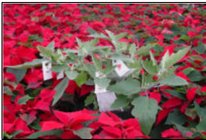
Eggplant guardian plant in poinsettias in a commercial greenhouse.

Insect pests are attracted to some plant cultivars more than others. Those plants act as a trap plant, drawing the pest away from the crop. Eggplants have been shown to serve that purpose for whiteflies. Why not use that trap plant as a site for controlling the pest by providing natural enemies to combat them? We tested eggplants as Guardian Plan Systems (GPS) in poinsettias at local commercial greenhouses. We supplied Eretmocerus eremicus , a whitefly parasitoid on the eggplants to control whiteflies. We found that the eggplants were highly attractive to whitefly adults and the parasitoids were always present. In some instances we found up to 12 times more whitefly on the eggplants than on the surrounding poinsettias and over time, more than 6 times more nymphs. Whiteflies were also found 1 week earlier on the eggplants than on standard sticky traps and it took significantly less time to find the whitefly using the eggplants as a quick scouting tool than by conducting random individual plant inspections. Pesticide usage was also reduced by 50 – 100%. For more information, please see “Guardian plant systems for greenhouse integrated pest management” handout.